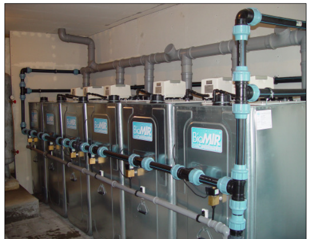
Small sewage plant with micro filtration