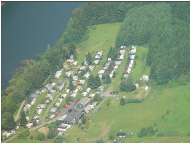
Aerial view of the camping ground