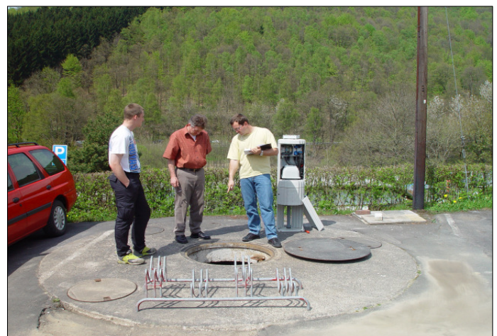
Septic tank with control unit