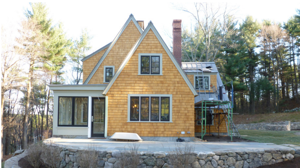
Exterior view of the Essex House of the US-TV-Show „This Old House“

„This Old House“ is an American home improvement magazine and television series. „Old houses“ are being remodeled over a number of weeks. They become true gems with modern design and sophisticated technical solutions. In the „Essex House“ for instance a BUSSE-MF has been applied. For more information please see: http://www.thisoldhouse.com (The Essex House)