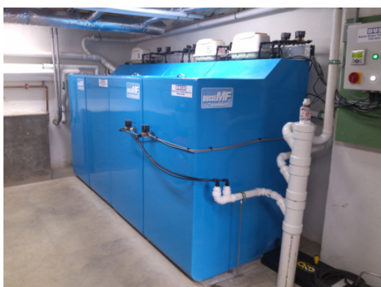
Installation of the BUSSE-MF in the basement of the house